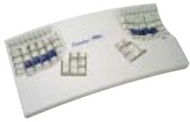
Essential - White Only