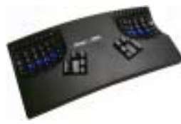
Classic - White & Black