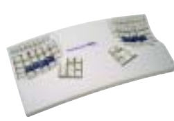
Professional - White & Black