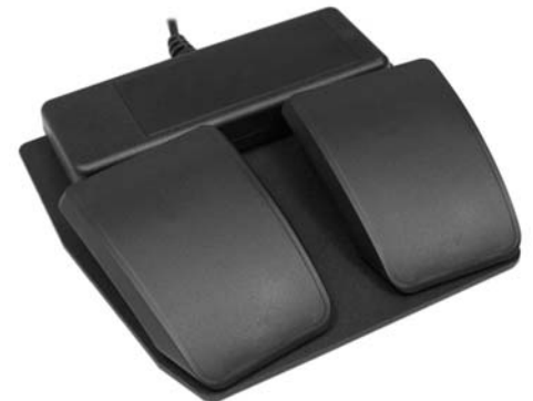
Figure 2. Dual foot switch, FS007DAF