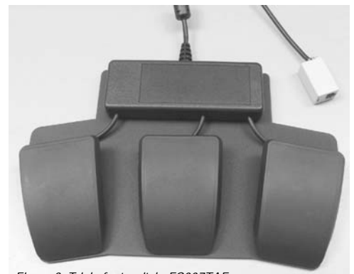
Figure 3. Triple foot switch, FS007TAF